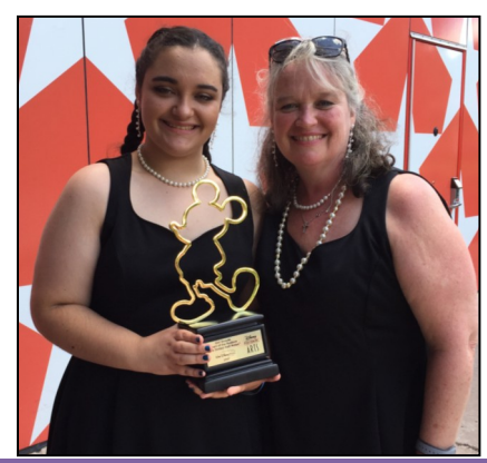
Yeah! We received the Golden Mickey!