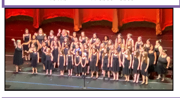
Six Flags New England Music in the Park - 1st Place