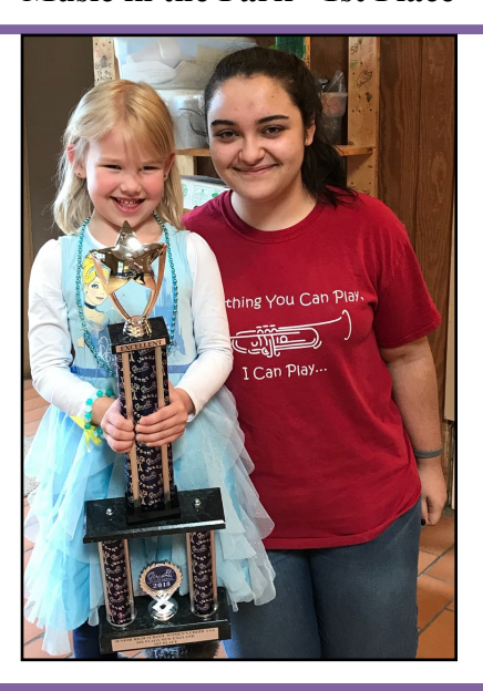
Walt Disney World